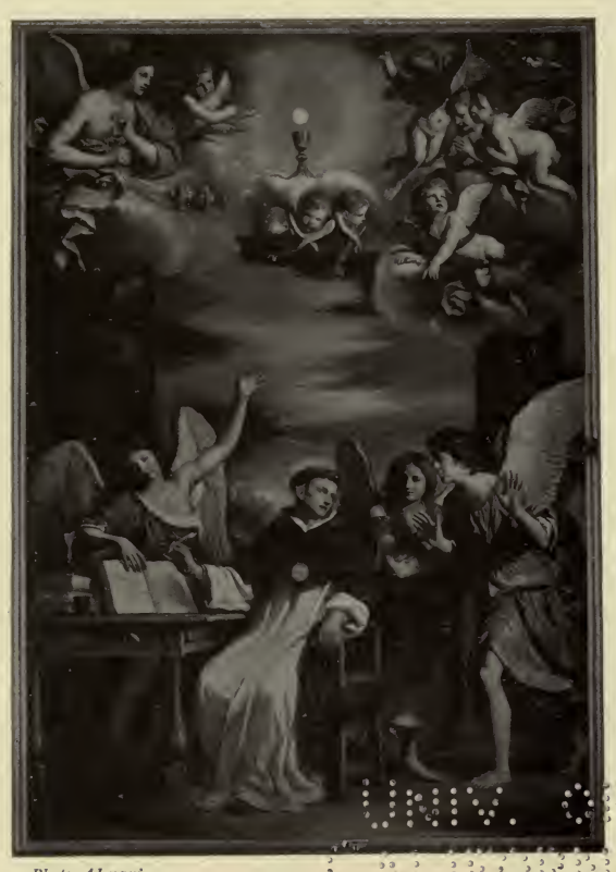
ALTAR-PIECE BY GUERCINO, IN THE CHAPEL OF ST. THOMAS AQUINAS, CHURCH OF ST. DOMINIC, BOLOGNA