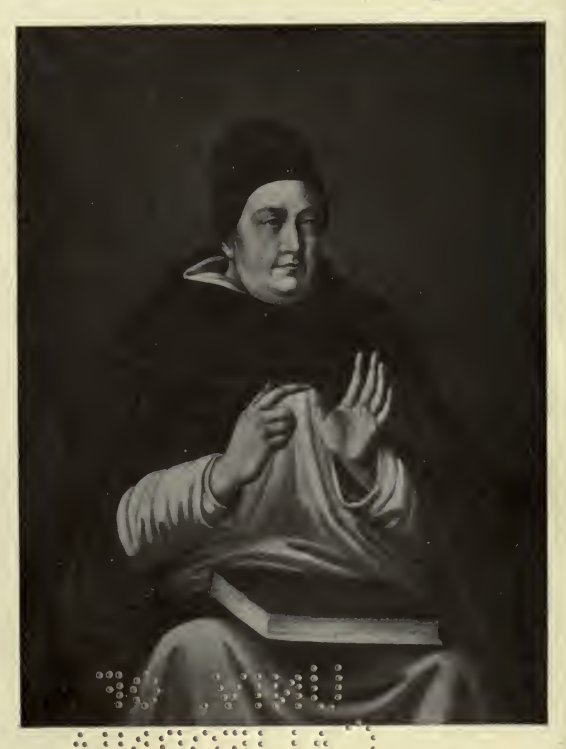
"DIVUS "NIOMAS GUEM DISCEPTILUS E VIVO EXPRESSIT" FROM PORTRAIT NOW IN COLLEGIO ANGELICO, ROME, BY UNKNOWN ARTIST, ALMOST CONTEMPORARY.