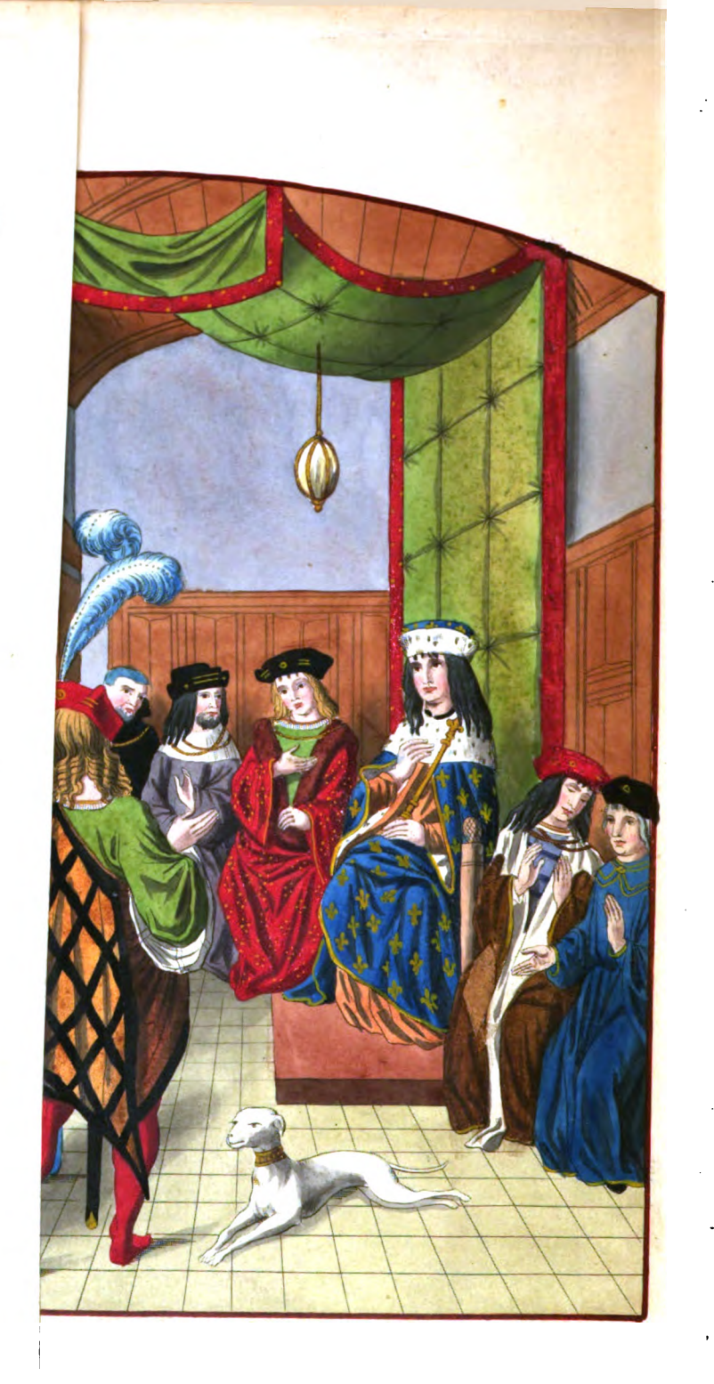
ed The to Charles VIII at Chinen .